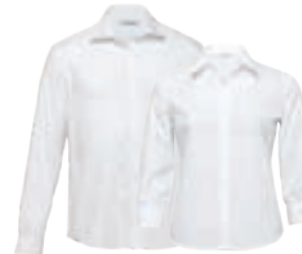
TE, WTE: WHITE PAGE 38