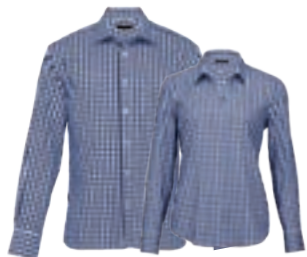
THC, WTHC: NAVY/WHITE PAGE 8