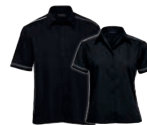
TMT, WMT: BLACK/WHITE PAGE 56