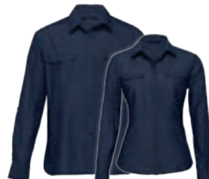
TG, WTG: INDIGO PAGE 48