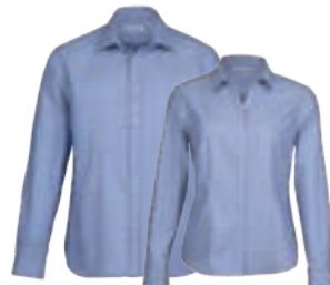
TFL, WTFL: NAVY/WHITE PAGE 22