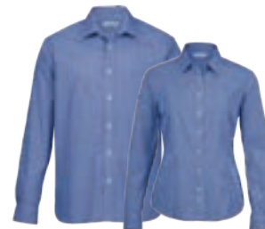
TKC, WTKC: NAVY/WHITE PAGE 6