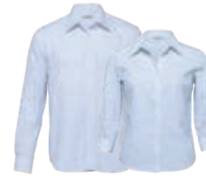
TAX, WTAX: WHITE/MID BLUE PAGE 14