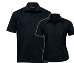
TL, WTL: BLACK PAGE 52