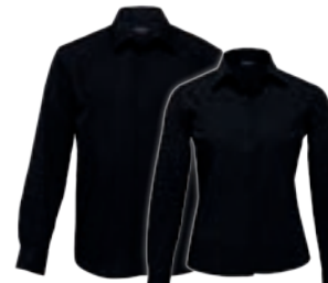
TRLS, WTRLS: BLACK PAGE 42