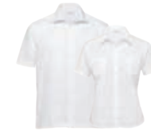
TL, WTL: WHITE PAGE 52