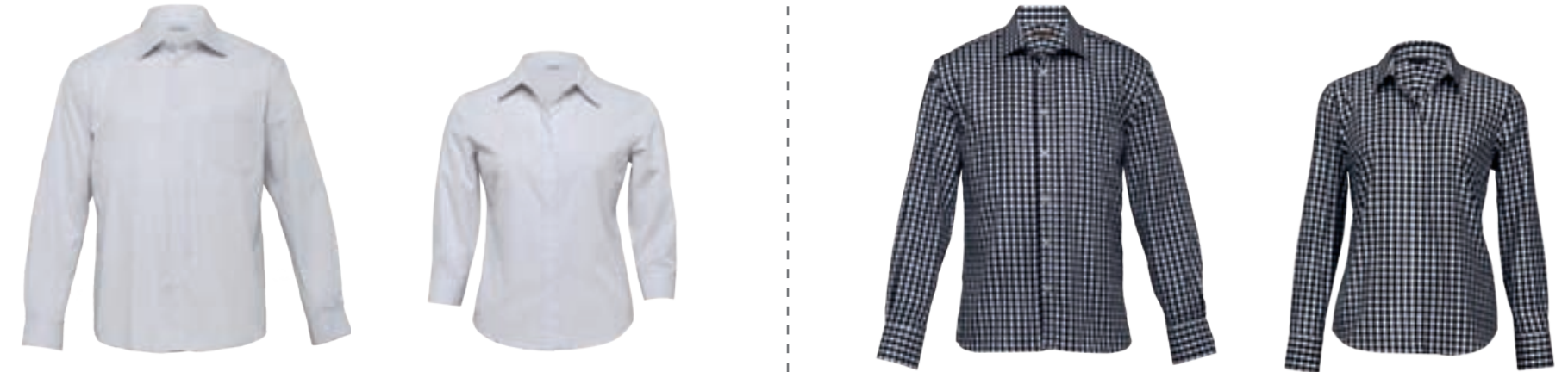
CLASSIC FIT SHIRTS Relaxed looser modern fit

Throughout our catalogue you will find products available in Classic Fit or Tapered Fit styles, allowing you to choose the right fit for you. We offer a wide range of sizes for both Men and Women. Refer to the garment measurement guidelines below. Full details are available on the individual garment pages.