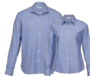
TIC, WTIC: FRENCH BLUE/WHITE PAGE 2