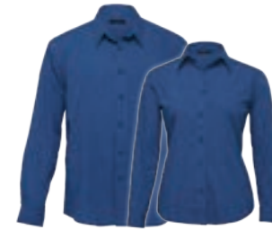
EOE, WEOE: FRENCH BLUE PAGE 24