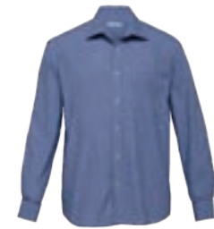
TSC: NAVY/WHITE PAGE 16