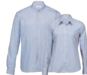
TCDH, WTCDH: WHITE/NAVY/BROWN PAGE 4