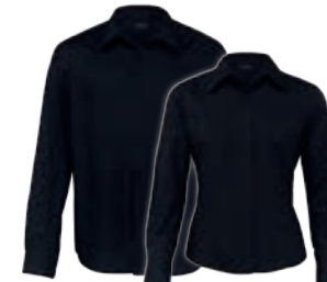
TV, WTV: BLACK PAGE 40