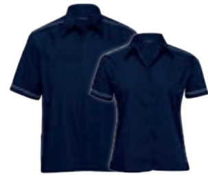
TMT, WMT: NAVY/WHITE PAGE 56