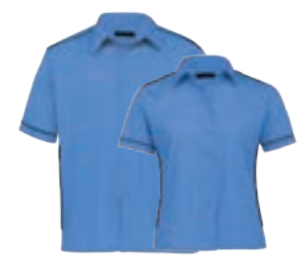
TMT, WMT: OCEAN/NAVY PAGE 56