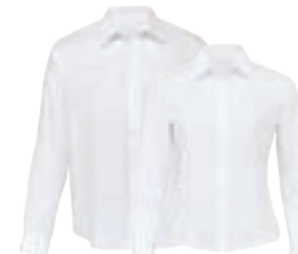
TV, WTV: WHITE PAGE 40