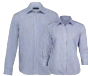
TF, WTF: WHITE/NAVY PAGE 12