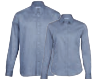
TBT, WBT: STEEL NAVY PAGE 18