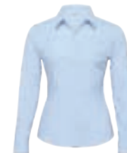
WTMO: EGGSHELL PAGE 50