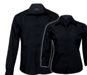
TE, WTE: BLACK PAGE 38