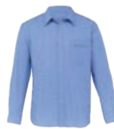
TTBL: BLUE/WHITE PAGE 28