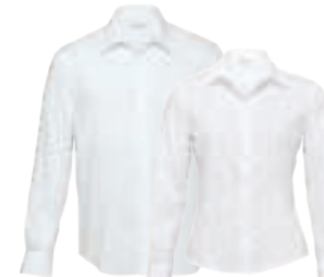
TRLS, WTRLS: WHITE PAGE 42