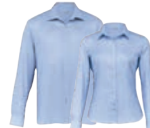
TNP, WTNP: BLUE/WHITE PAGE 20