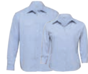
TU, WTU: BLUE/WHITE PAGE 26