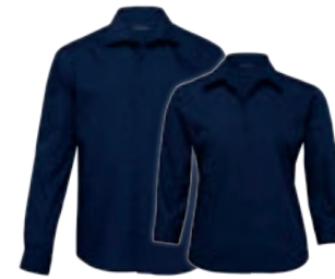
TE, WTE: NAVY PAGE 38

Our wide range of men's and women's woven shirts offer you a selection of his and her styles to create your working wardrobe. The Standard offers coordinating colour pallets to create a cohesive, well tailored look for your business uniform.