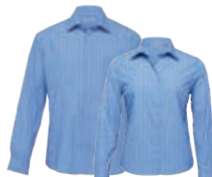
ES, WES: BLUE/WHITE PAGE 34