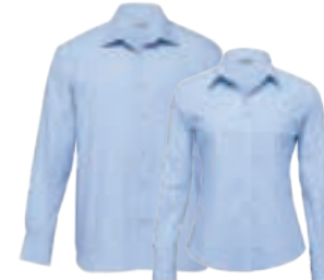
TBC, WTBC: SKY/WHITE PAGE 10