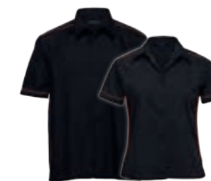
TMT, WMT: BLACK/RED PAGE 56