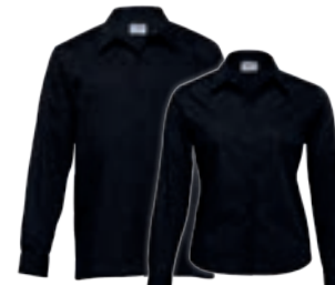
TEL, WTEL: BLACK PAGE 36