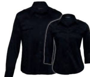
TPL, WTPL: BLACK PAGE 46