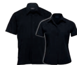
TRSS, WTRSS: BLACK PAGE 54