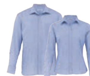
TYS, WTYS: BLUE/WHITE PAGE 30