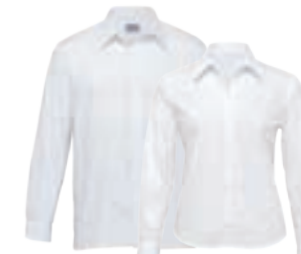
TEL, WTEL: WHITE PAGE 36